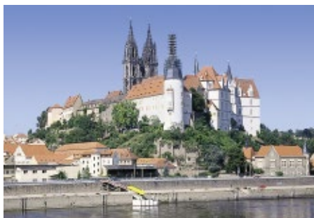
🦉 View across the Elbe to castle hill in Meissen with the Bishop's Palace, Cathedral and Albrechtsburg Castle

🦉 In Cranach's day, the town of Meissen on the river Elbe had become less influential than Dresden, the royal seat of the House of Wettin, but it nonetheless remained the seat of a Protestant cathedral chapter. The Wettins, who had been invested with the Margraviate of Meissen in 1089, not only initiated the construction of the Gothic cathedral but also had a magnificent mausoleum built in front of its west portal from 1415. The memorial stone of Frederick the Belligerent , Elector of Saxony, in the royal chapel was cast in the workshop of Peter Vischer the Elder in Nuremberg. It depicts the duke, who died in 1510, as the Grand Master of the Teutonic Order. It is thought to be based on a drawing by Lucas Cranach, which would make it the oldest reference to the artist in Meissen.