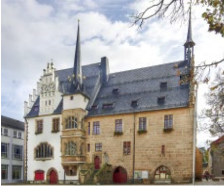
🏰 Late-Gothic Town Hall

🏰 Neustadt an der Orla lies amid arable countryside far removed from the tourist trail. The town has many fascinating sights, particularly in its heritage-listed medieval centre.