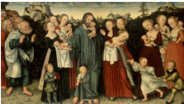
👉 Let the children come to me, around 1537

👉 At the Anger Museum of Art there are twelve works, primarily from the workshop of Cranach the Elder, Cranach the Younger and their contemporaries. Among the most significant is Let the Children Come to Me . The painting was created in around 1537 and features Cranach's characteristic winged serpent insignia.