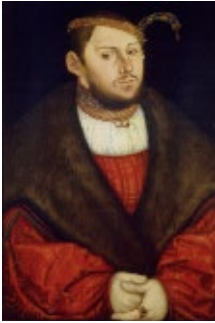
✦ Elector Johann Friedrich of Saxony, 1526