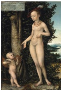
🦋 Venus and Cupid the Honey Thief, 1534