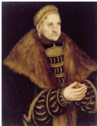
🦋 Elector Frederick the Wise, around 1513

🦋 In August 1506 Lucas Cranach the Elder, who had been based in Wittenberg as court painter to the Saxony Electorate since 1505, went to Coburg for a biannual hunting party in the company of Elector Frederick the Wise and his brother John the Steadfast. He resided at the fortress and accompanied the Saxon rulers so that he could perfect his portrayal of the hunt. In that year, he created a series of accomplished wood carvings with hunting themes and other motifs. Some of them show the fortress, where Cranach had decorated the banqueting hall with hunting scenes. From an artistic perspective, this exceptionally creative stay at Coburg Fortress proved to be an important milestone at the beginning of Cranach's career as a court painter. Although the wall paintings have been lost, the portraits of the Elector and his brother from around 1515, which were probably part of an altar created for the castle church, have survived.