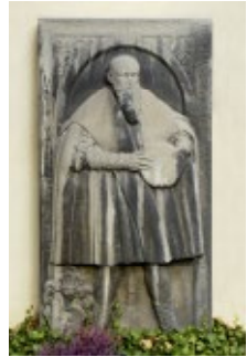
✦ The gravestone of Lucas Cranach the Elder