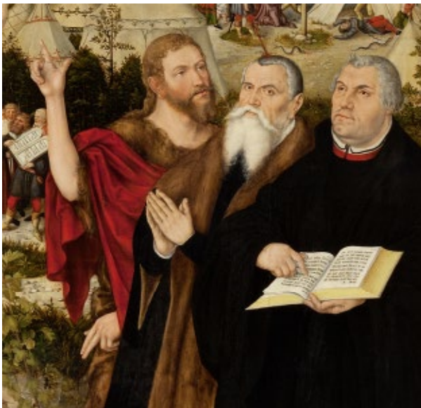
✠ John the Baptist, Lucas Cranach the Elder and Martin Luther, section of the Cranach altar by Lucas Cranach the Younger in the Church of St Peter and St Paul in Weimar, completed 1555

first Reformation altar that Lucas Cranach the Elder and his workshop created for St Wolfgang's Church in Schneeberg, Saxony. At Coburg Fortress, the Herzogliches Museum (ducal museum) in Gotha and the Germanic National Museum in Nuremberg, you can marvel at a great number of Cranach's paintings. Nuremberg is also the city where, in 1508, Elector Frederick the Wise granted Lucas Cranach the Elder a coat of arms depicting a crowned serpent with bat wings and a ruby ring – the distinctive signet with which Cranach signed his paintings from then on.