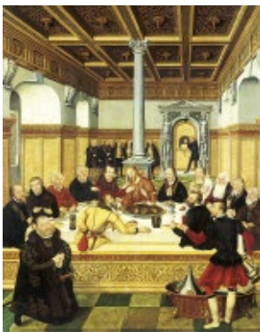
♥ Lucas Cranach the Younger, Last Supper , 1565