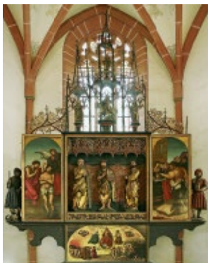
🏠 Cranach altar in St John's Church, 1513

ment on the predella, and appreciate the rich sculptures and reliefs illustrating the lives of the saints and Biblical stories in Cranach's early artistic style.