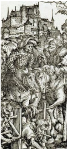
✦ The Martyrdom of St Erasmus, 1506, with a depiction of Coburg Fortress

✦ Coburg Fortress houses around 30 paintings by Cranach and his workshop. These mainly feature in the permanent exhibition on Early German paintings in the stone building, while further works can be seen in the Luther Rooms and in the sitting room of the last ruling Duke of Saxe-Coburg and Gotha, formerly known as the Cranach Room due to its decoration. In the Great Court Chamber, you can browse a digital version of the richly detailed tournament book belonging to Elector Johann Friedrich I of Saxony featuring 146 images from the Cranach workshop from 1534/35.