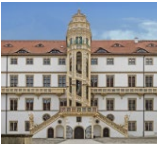
🦁 Hartenfels Palace and the Grand Staircase

🦁 Cranach's The Fourteen Holy Helpers can be seen in St Mary's Church in Torgau near the memorial stone of Sophie von Mecklenburg, Electress of Saxony. The panel,