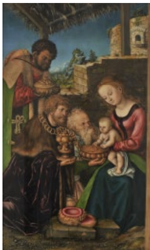
✦ Worship of the kings, around 1513/15