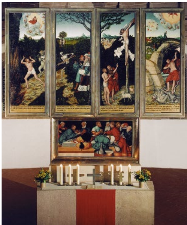
✚ Reformation altar in St Wolfgang, 1539, work day side

🔥 On the back of the Reformation altar there are two pictures at the side showing the Old Testament stories of The Flood and Sodom and Gomorrah . The message of the resurrection, salvation after death , is on the central panel. When members of the congregation take Holy Communion during Mass, they pass around the altar and also see the reverse side.