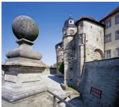
🦋 Rosenberg Fortress

🦋 Lucas Cranach was born here in 1472, the son of Hans Maler. He later called himself after his home town. Cranach's relative Matthias Gunderam wrote in his biography in 1556 that Lucas was trained in the graphic arts by his father.