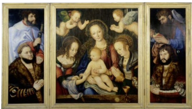
✚ Prince's Altar, 1507–1509

✚ Once the royal seat of Anhalt, the town of Dessau holds the most remarkable and most extensive collection of works by Lucas Cranach the Elder in Saxony-Anhalt, including altarpieces and panel paintings at the Anhalt Art Gallery in Georgium Palace and in St John's Church . Especially the Prince's Altar , Catherine's Altar and the panel painting of the Last Supper are among the most important works of Cranach and his son, Lucas Cranach the Younger. A richly illustrated, three-volume Cranach Bible is also kept at the Anhalt State Library. Only 40 kilometres from Wittenberg (the centre of Cranach's work), Dessau was an important town in the spread of Protestantism and the reformed faith under the rule of Prince Georg III of Anhalt. The Last Supper is a bold and equally ambitious reference to it, and shows Luther, Melancthon and Georg III of Anhalt celebrating the Last Supper with Christ, together with other leading figures of the Reformation as the disciples.