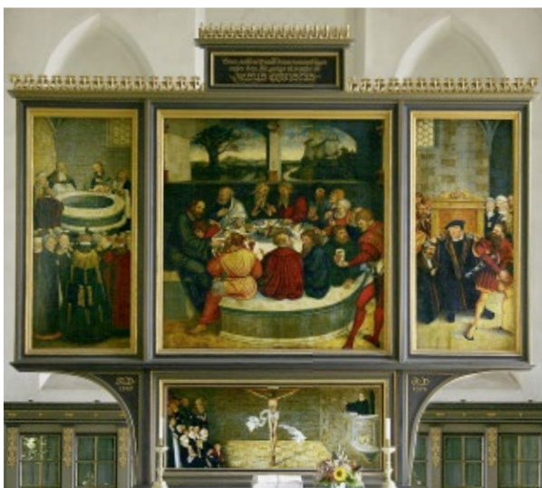
📌 Cranach altar in St Mary's Church, 1547