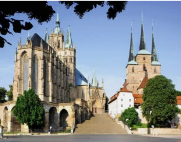
✚ St Mary's Cathedral and the Church of St Severus

✚ Today Erfurt has an impressive collection of exceptional paintings by Cranach. Among them is The Mystic Marriage of St Catherine with St Catherine and Barbara, a panel painting by Lucas Cranach the Elder thought to date from around 1520. It can be found in the northern aisle of St Mary’s Cathedral in Erfurt and was only incorporated into the baroque altar in 1948.