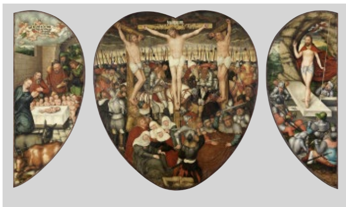
📍 Lucas Cranach the Younger, heart-shaped winged altarpiece (Colditz altarpiece), 1584

📍 A tour of the Germanic National Museum takes us from father to son. The heart-shaped winged altarpiece by Lucas Cranach the Younger (1584) is displayed in the section on Art in around 1600 , showing how contrasting styles existed alongside one another during this period.