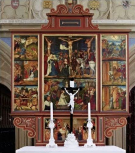
✦ Workshop of Lucas Cranach the Elder, retable of the Crucifixion altar , 1526

decorated with a trptych painted by Lucas Cranach the Elder. It was later a cause of some surprise that the so-called creator of Lutheran imagery and court painter of the Protestant Elector had accepted a commission from this “bastion of orthodoxy” and “adversary of the Reformation”. But as we know today, this fully reflected Cranach’s prominent position as an artist and the pragmatic function of art in his day.