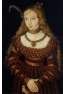
✦ Sibylle of Cleves, 1526