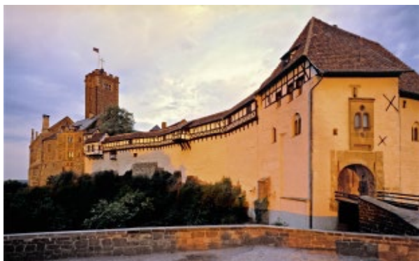
🦉 Wartburg Castle near Eisenach, UNESCO World Heritage site

🦉 At that time, the castle had entered a quieter period and the extravagant celebrations of the Middle Ages were long past. Wartburg Castle guaranteed the necessary safety and seclusion for the excommunicated – and during the Diet of Worms ostracised – monk, who shook the Roman Catholic Church. From 4 May 1521 until 1 March the following year, Luther remained in hiding at his 'Patmos' and it was one of the most productive periods of his life. His translation of the New Testament is regarded as a defining moment in the development of a standardised German language.