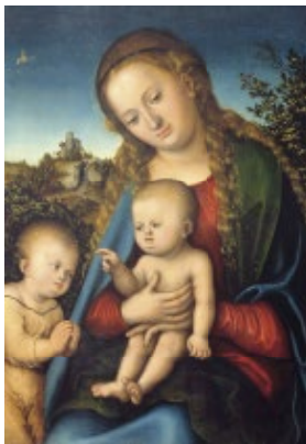
🦋 Madonna with Child and Young John the Baptist, around 1512/14