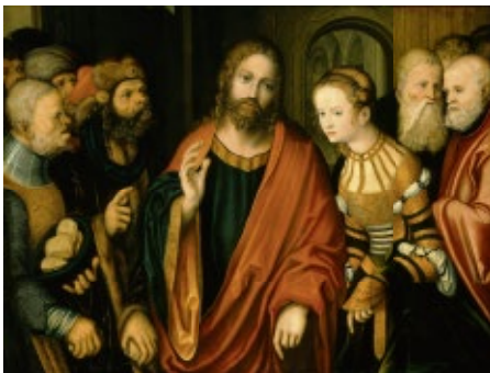
✦ Christ and the Adulteress, around 1520

✦ Majestically towering above the town of Kronach is Rosenberg Fortress, which today exhibits Cranach's later works such as Christ and the Adulteress , around 1520, Lot and his Daughters , 1533, Man of Sorrows , after 1537, and Venus and Cupid the Honey Thief , 1534. As well as Cranach's paintings, the Franconian Gallery at the fortress houses a prestigious permanent exhibition of late-Gothic Franconian art from the holdings of the Bavarian National Museum in Munich. Particularly noteworthy are the outstanding sculptures by Tilman Riemenschneider and his peers, and portraits by Dürer's contemporaries.