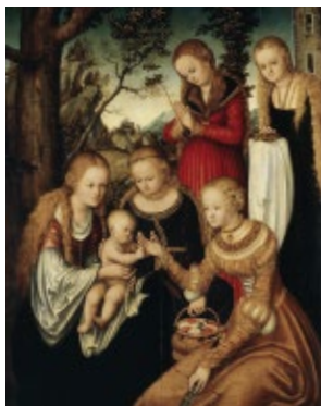
♥ Catherine's Altar, 1516

✎ The Marian themes evident in the Dessau collection are characteristic of the early works of the Catholic painter. However even in these works it is possible to recognise the more secular treatment of holy figures that was characteristic of Cranach, and his intensive portrayal and characterisation of man and nature. In the works of Cranach the Younger, there is a tendency – in the spirit of the Reformation – to consciously reduce the use of rich, emotional depictions in favour of the matter-of-fact Biblical word of God. Two mythological paintings and some outstanding portraits round off the collection in Dessau. The Cranach paintings are part of a valuable collection of works by Renaissance painters such as Hans Baldung Grien, Bartel Bruyn, Hans Mielich, Hans Maler and others.