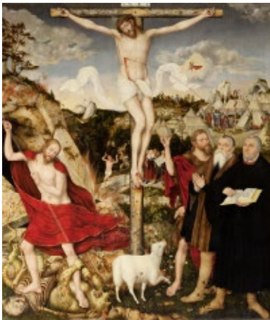
👉 Section of the Cranach altar in the Church of St Peter and St Paul, completed in 1555 by Lucas Cranach the Younger, with portraits of Lucas Cranach the Elder and Martin Luther

👉 After Duke Johann Friedrich I the Magnanimous had lost the electoral dignity, Cranach followed him to the new ducal seat of Weimar. Today, the collection of the Foundation of Weimar Classics contains several of the artist's