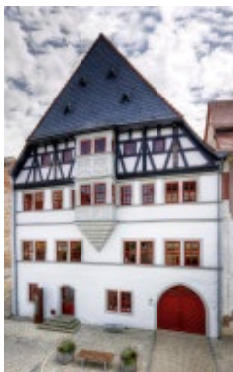
🏠 Luther's House

🏠 This precious altar from Wittenberg arrived in 1513, carefully transported on three wagons. Because Martin Luther wanted to protect the artwork of his friend Cranach in 1524, it has remained unchanged in this location to this day – quite unique for an altarpiece by Cranach the Elder. Today you can appreciate this magnificent altar in its original setting, closely examine the depiction of the Last Judge-