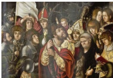
✦ The Fourteen Holy Helpers altarpiece in St Mary's Church