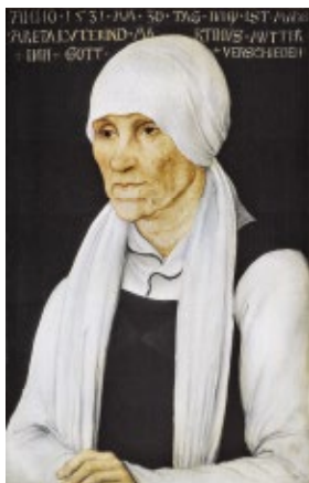
📌 Margarete Luther, 1527