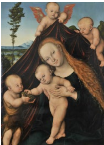
✦ Madonna with Child and Young John the Baptist, by Lucas Cranach the Younger, 1534